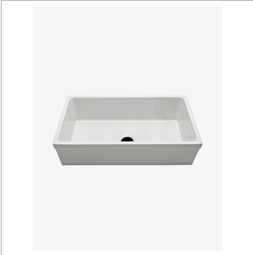
SHOWN IN CLAYBURN 35 1/2" X 19 3/4" X 10" FIRECLAY FARMHOUSE APRON KITCHEN SINK WITH CENTER DRAIN| CASK54

Clayburn 35 1/2" x 19 3/4" x 10" Fireclay Farmhouse Apron Kitchen Sink with Center Drain