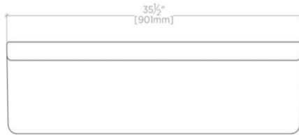
FRONT VIEW SCALE: 1"=1'-0"