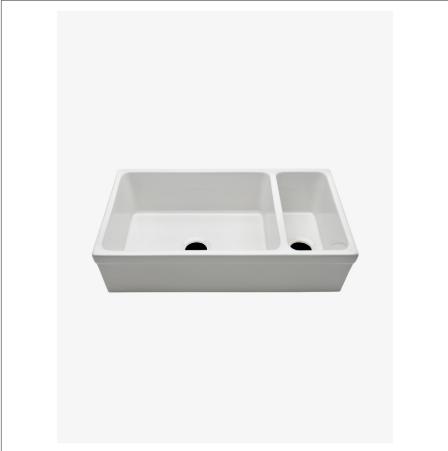
SHOWN IN CLAYBURN 35 1/2" X 19 3/4" X 10" DOUBLE FIRECLAY FARMHOUSE APRON KITCHEN SINK WITH CENTER

Clayburn 35 1/2" x 19 3/4" x 10" Double Fireclay Farmhouse Apron Kitchen Sink with Center Drains